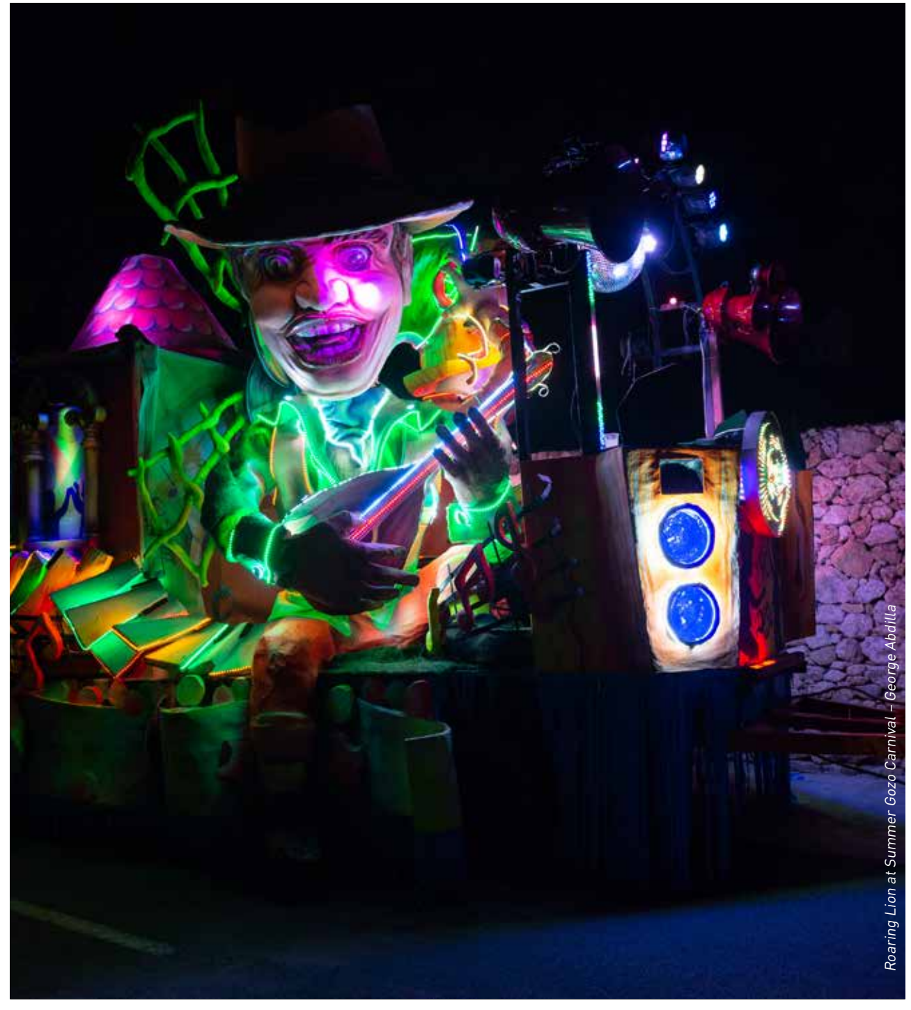
40 I STRATEGY 2025 / ARTS COUNCIL MALTA